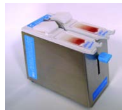
Step 4: Release