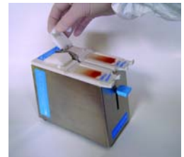
Step 5 : Clean glass