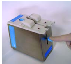
Step 3 : Press down