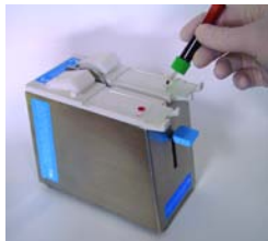
Step 2: Drop blood