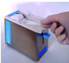
Step 1: Place slide

Specifications: 6' x 4' x 6' (L x W x H) 3.2 lbs. • 15cm x 10cm x 15cm (L x W x H) (1.45 Kg)