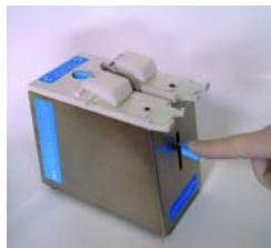
Step 3: Press down